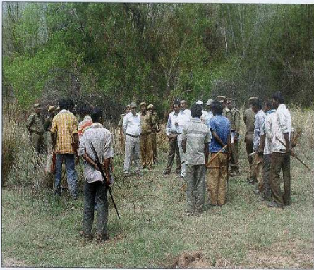
Chenchus During interaction