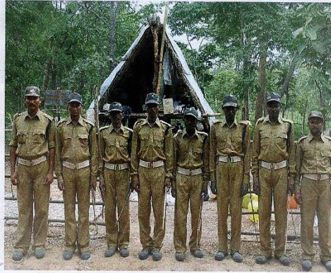
Chenchus Brigade at base Camp