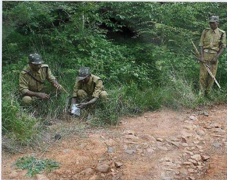
Chenchus on monitoring Tigers and collection of evidences