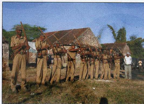
Chenchus converted as formidable Tiger protection force

terrain, protecting the forests and wildlife wealth. Forest Department has provided them with facilities like Uniform, Ration, Medicine and lighting facilities at the Base camps. Their works are thoroughly reviewed through interaction