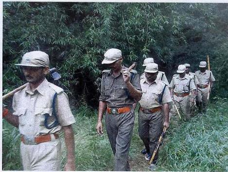
On foot Patrolling